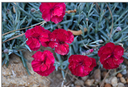
Frosty Fire Pinks flowers