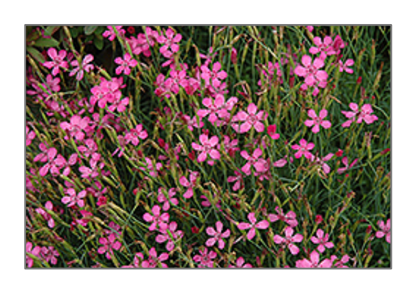
Shrimp Maiden Pinks flowers