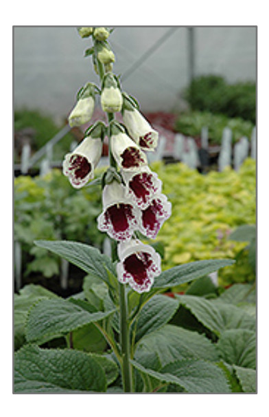
Pam's Choice Foxglove flowers

Features elegant white tubular flowers with burgundy throat and black spots; tall spikes rise above attractive green lance-shaped leaves; a biennial that's happiest in part shade with adequate moisture