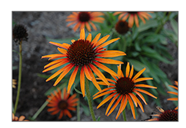
Flame Thrower Coneflower flowers

Fragrant, bright bicolor gold and red flowers with dark center cone; great for flower arrangements; attracts pollinators and feeds the birds at winter; use in naturalized areas