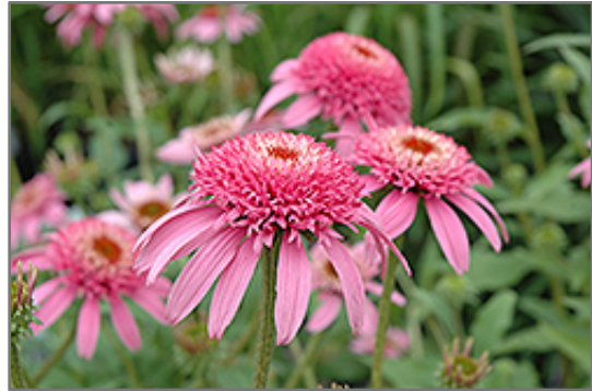
Cone-fections Pink Double Delight Coneflower flowers

Cone-fections Pink Double Delight Coneflower is recommended for the following landscape applications;