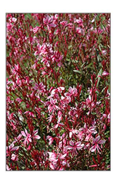
Belleza Gaura flowers

Belleza comes in light pink, dark pink and white; its airy flowers and compact growth make this plant great for containers; attractive to butterflies; tolerant of heat, drought and humidity; non-flopping type