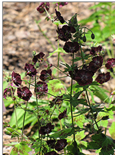
Samobor Cranesbill in bloom

Samobor Cranesbill is recommended for the following landscape applications;