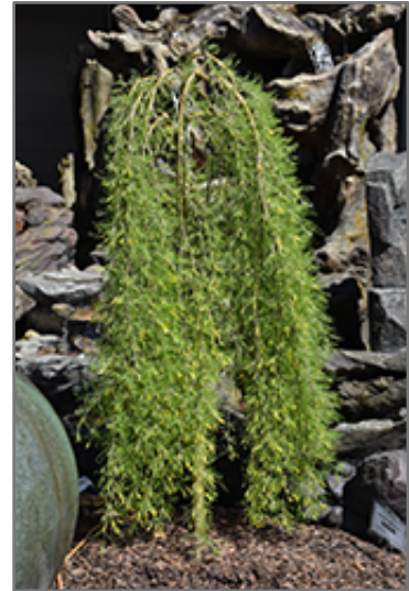
Walker Weeping Peashrub