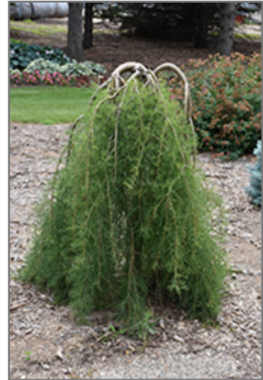
Walker Weeping Peashrub

This shrub does best in full sun to partial shade. It prefers dry to average moisture levels with very well-drained soil, and will often die in standing water. It is considered to be drought-tolerant, and thus makes an ideal choice for xeriscaping or the moisture-conserving landscape. It is not particular as to soil type or pH, and is able to handle environmental salt. It is highly tolerant of urban pollution and will even thrive in inner city environments. This is a selected variety of a species not originally from North America.