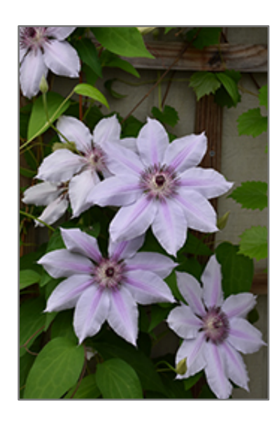
Nelly Moser Clematis flowers