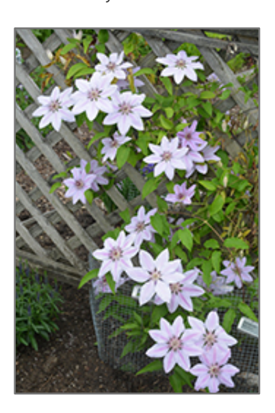
Nelly Moser Clematis in bloom