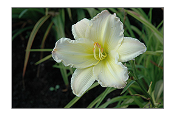
Big Smile Daylily flowers