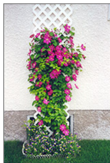
Ville de Lyon Clematis in bloom