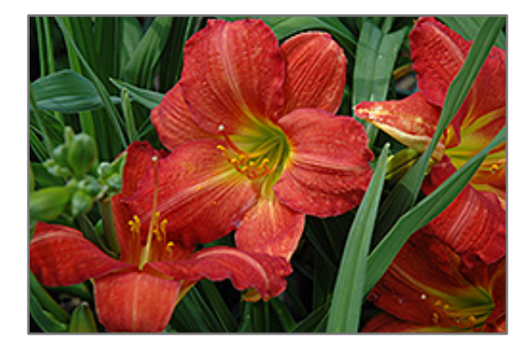
Red Rum Daylily flowers