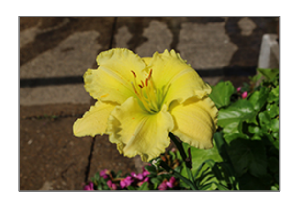
Siloam Amazing Grace Daylily flowers