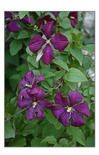
Etoile Violette Clematis flowers

Etoile Violette Clematis features showy deep purple star-shaped flowers with buttery yellow anthers at the ends of the branches from mid summer to mid fall. It has green deciduous foliage. The compound leaves do not develop any appreciable fall colour.