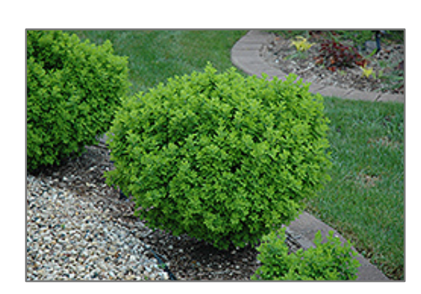
Globe Peashrub

An excellent compact and consistently rounded shrub for low hedges or garden detail; extremely hardy and adaptable to very dry sites, doesn't sucker, takes pruning very well