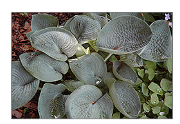
Abiqua Drinking Gourd Hosta foliage

Large leaved ornamental blue-green leaves are cupped, nearly round and have a dull glaucous bloom; provides beautiful texture and contrast to other plants; near-white spikes of flowers in mid-summer