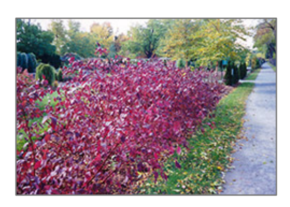
Siberian Pearls Dogwood in fall

One of the finest shrub dogwoods with so much going for it; showy white berries that turn to blue in fall, excellent fall color and stunning red stems which stand out against the winter snow; can grow quite large for general garden use