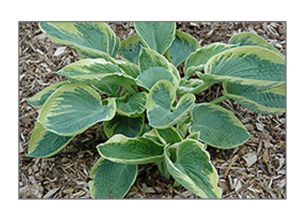
Northern Halo Hosta foliage

A wonderful upright mounded variety ideal for shaded beds and borders; presents mounds of thick, heart shaped and heavily corrugated blue-green foliage with creamy white margins; white flowers appear on tall scapes during the midsummer months