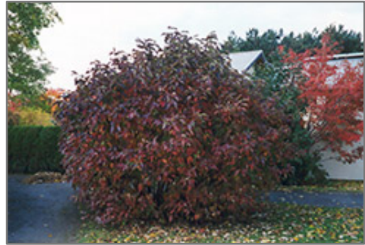
Siberian Dogwood in fall

This shrub does best in full sun to partial shade. It is an amazingly adaptable plant, tolerating both dry conditions and even some standing water. It is not particular as to soil type or pH. It is highly tolerant of urban pollution and will even thrive in inner city environments. This is a selected variety of a species not originally from North America.