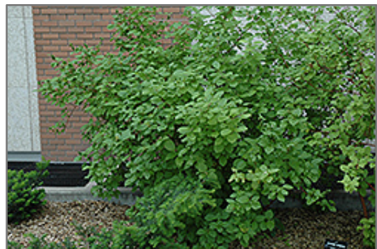
Siberian Dogwood