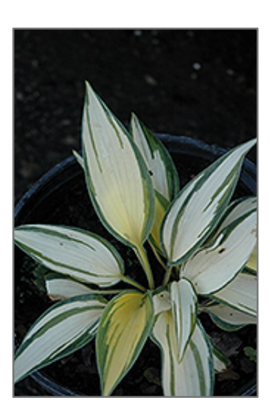
Remember Me Hosta foliage

Very cool leaves with chartreuse centres and when you look up-close you'll notice the blue-green margin with streaks of green