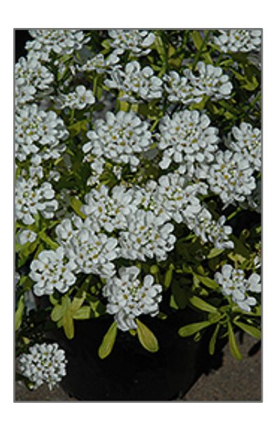
Golden Candy Candytuft flowers