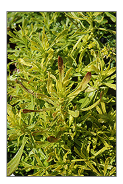
Golden Candy Candytuft foliage