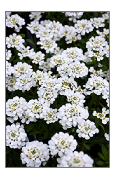
Purity Candytuft flowers