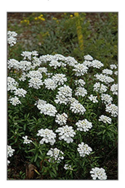
Purity Candytuft flowers