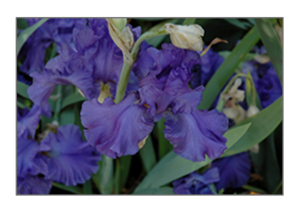
Breakers Iris flowers