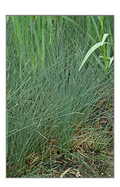
Soft Rush

Soft Rush is primarily valued in the garden for its ornamental upright and spreading habit of growth. Its attractive grassy leaves emerge lime green in spring, turning bluish-green in colour throughout the season.