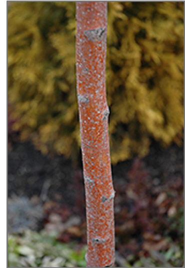
Toba Hawthorn bark

This tree does best in full sun to partial shade. It is very adaptable to both dry and moist growing conditions, but will not tolerate any standing water. It is not particular as to soil type or pH. It is somewhat tolerant of urban pollution. This particular variety is an interspecific hybrid.