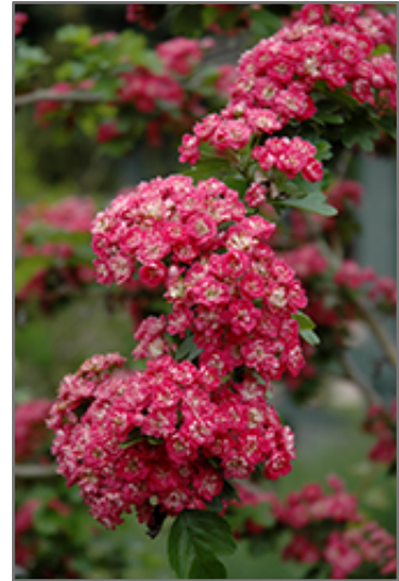
Toba Hawthorn flowers

Toba Hawthorn is recommended for the following landscape applications;