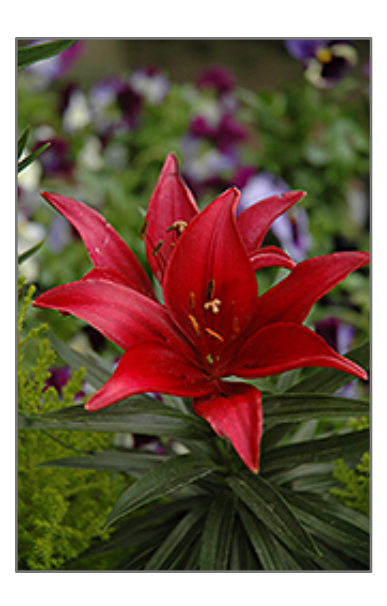
Lily Looks Tiny Ghost Lily flowers

This variety is a compact lily that bears well formed, upward facing, deep burgundy blooms; perfect for containers or massing along borders; they are also known to have multiple blooms per stem