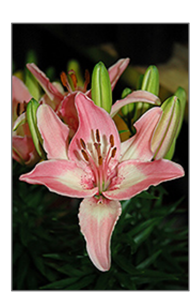
Lily Looks Tiny Todd Lily flowers

This variety is a compact lily that bears well formed, upward facing, soft pink blooms; perfect for containers or massing along borders; they are also known to have multiple blooms per stem