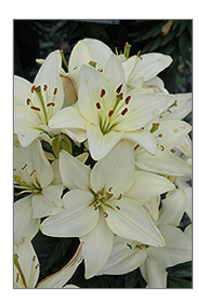
Lily Looks Tiny Nanny Lily flowers

This variety is a compact lily that bears well formed, upward facing, pure white blooms; perfect for containers or massing along borders; they are also known to have multiple blooms per stem