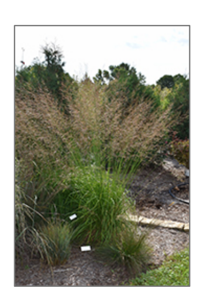
Skyracer Moor Grass