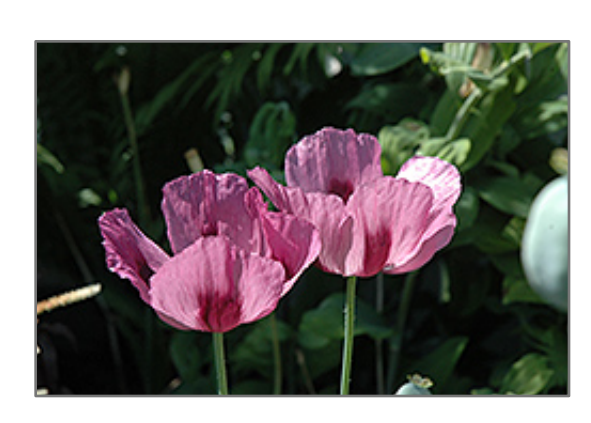
Patty's Plum Poppy flowers

This exquisite selection is sought after for good reason; the numerous six inch wide ruffled plum purple to lavender flowers display contrasting blotches and deep purple centers; stunning when massed in mid-border plantings