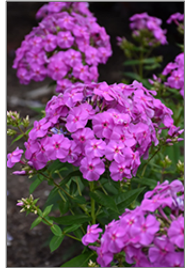
Flame Lilac Garden Phlox flowers

Flame Lilac Garden Phlox is recommended for the following landscape applications;