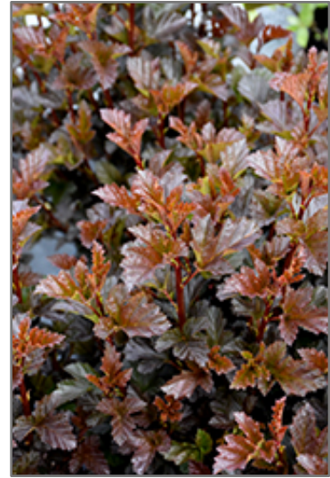
Satin Chocolate Ninebark foliage