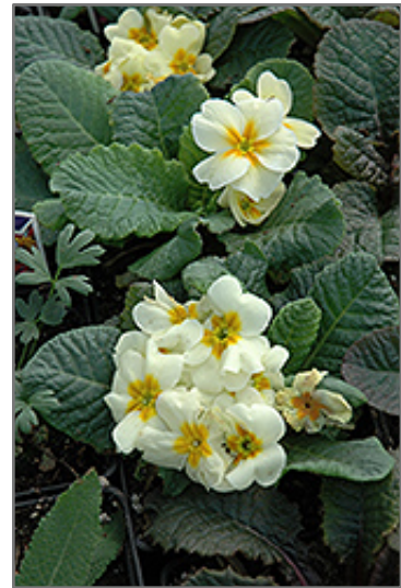
Wanda Primrose flowers

Wanda Primrose is recommended for the following landscape applications;