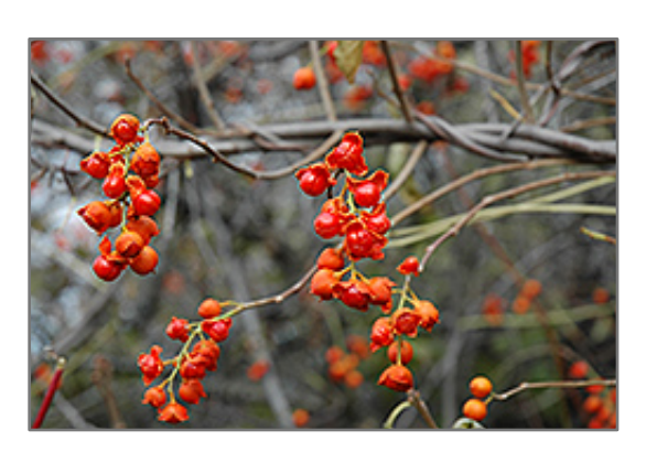
American Bittersweet fruit