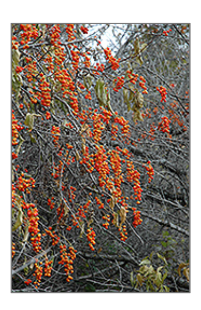
American Bittersweet fruit