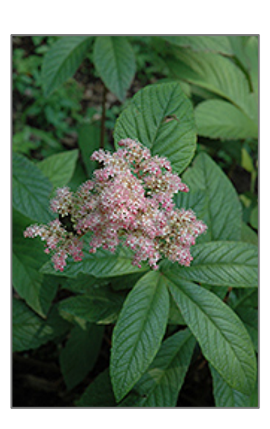
Chocolate Wings Rodgersia flowers

Finely cut leaves are deep cocoa bronze when they emerge turning dark green; striking nodding plumes of hot pink flowers in early summer make a great display; recommend partial shade but moist soils are a necessity when planting in full sun