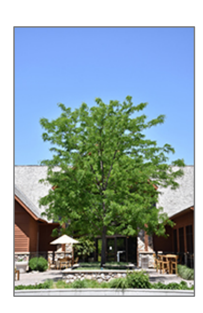
Skyline Honeylocust

Skyline Honeylocust has dark green deciduous foliage on a tree with a pyramidal habit of growth. The pinnately compound leaves turn an outstanding gold in the fall.