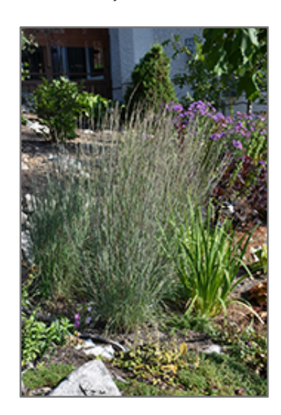
Little Bluestem in bloom