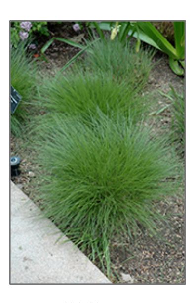
Little Bluestem