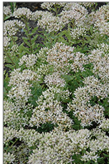
Thundercloud Stonecrop flowers

Thundercloud Stonecrop is a dense herbaceous perennial with a mounded form. Its relatively fine texture sets it apart from other garden plants with less refined foliage.