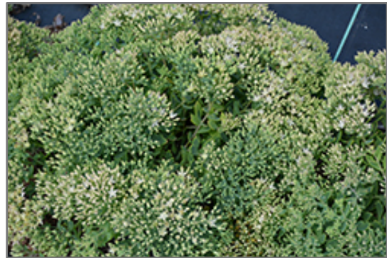
Thundercloud Stonecrop flower buds