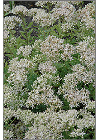
Thundercloud Stonecrop flowers

Thundercloud Stonecrop is a dense herbaceous perennial with a mounded form. Its relatively fine texture sets it apart from other garden plants with less refined foliage.