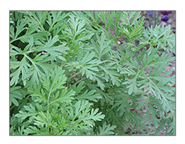
Absinthe foliage

This plant will require occasional maintenance and upkeep, and is best cleaned up in early spring before it resumes active growth for the season. Deer don't particularly care for this plant and will usually leave it alone in favor of tastier treats. It has no significant negative characteristics.