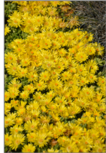
Yellow Ice Plant flowers

Yellow Ice Plant is recommended for the following landscape applications;