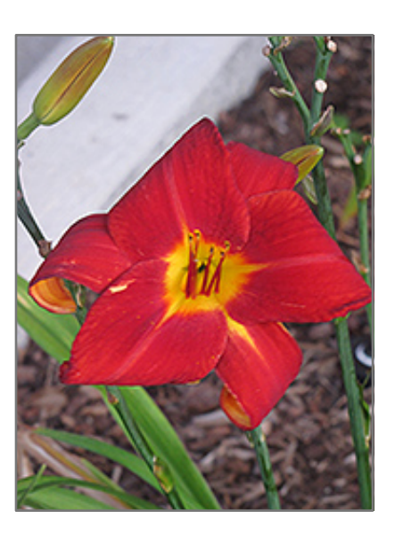
Autumn Red Daylily flowers

Day lilies are commonly grown garden plants; these hardy perennials require practially no maintenance and have large and attractive blooms similar to lily flowers; all parts of the plant are edible although the flowers are the most frequently used