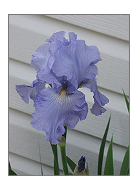
Babbling Brook Iris flowers

This tall stately iris with its incredible sky blue blooms and delicate veining is a unique, attractive addition to the perennial border; also excellent massed in groupings in the garden; will quickly form dense colonies