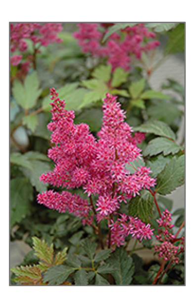
Elizabeth Bloom Astilbe flowers

Striking rich pink plumes rising above glossy leaves; foliage is bronze-green in spring; perfect in a shady spot with dappled light; prefers moisture so water regularly for abundant flowers and nice foliage