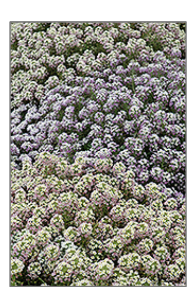
Pastel Carpet Alyssum flowers

Pastel Carpet Alyssum is covered in stunning clusters of fragrant white star-shaped flowers with pink overtones at the ends of the stems from mid spring to mid fall. Its tiny narrow leaves remain grayish green in colour throughout the season.