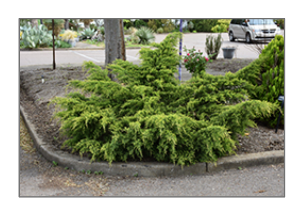
Gold Coast Juniper

A stunning color accent landscape evergreen; wide spreading and sprawling with arching branches in a striking gold, slightly droopy tips; a superb groundcover or massing plant for color with true character of habit when mature