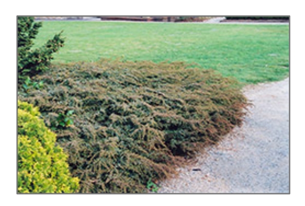
Effusa Juniper

A compact, low growing evergreen shrub with sharp bright green needles streaked with interesting silvery blue lines, holds color in winter; extremely adaptable to poor soils and dry locations, very hardy; makes an excellent groundcover