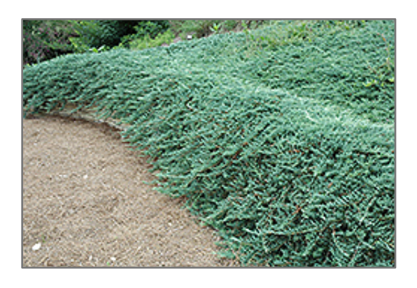
Bar Harbor Juniper

Bar Harbor Juniper is a multi-stemmed evergreen shrub with a ground-hugging habit of growth. It lends an extremely fine and delicate texture to the landscape composition which should be used to full effect.