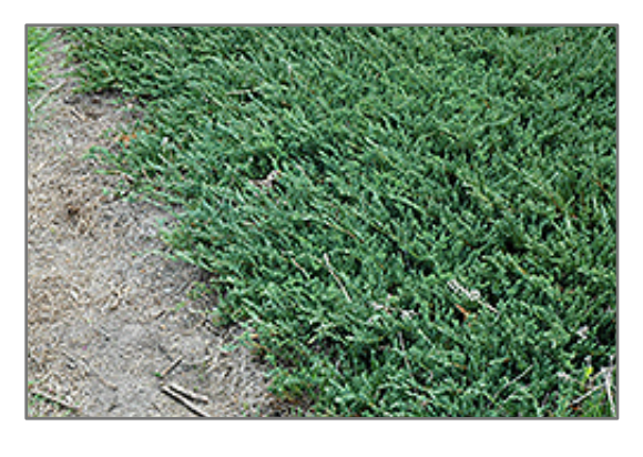
Bar Harbor Juniper

This is a relatively low maintenance shrub, and is best pruned in late winter once the threat of extreme cold has passed. Deer don't particularly care for this plant and will usually leave it alone in favor of tastier treats. It has no significant negative characteristics.