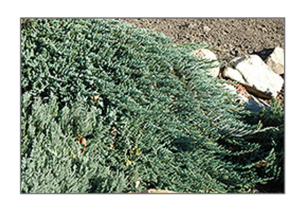
Blue Prince Juniper

An incredibly beautiful groundcover evergreen for home garden use, featuring steel blue foliage which takes on a purplish tinge in winter, ground hugging and wide spreading; extremely adaptable and hardy; a top notch color accent groundcover