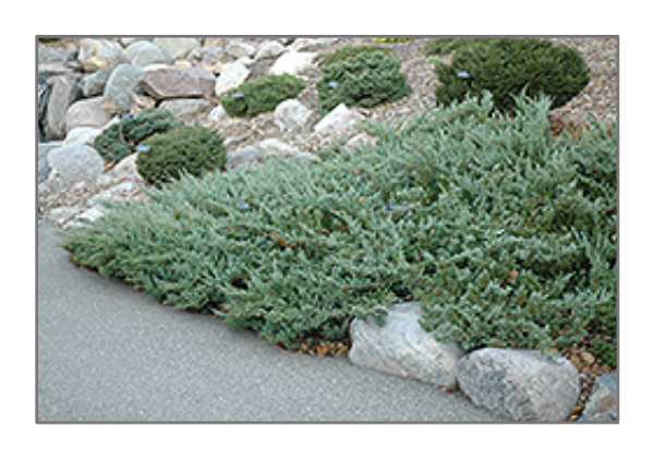
Hughes Juniper

A top notch and popular groundcover evergreen for color accent use in the landscape, featuring silvery-blue foliage all season long, ground hugging and wide spreading; extremely adaptable and hardy; superb color accent groundcover