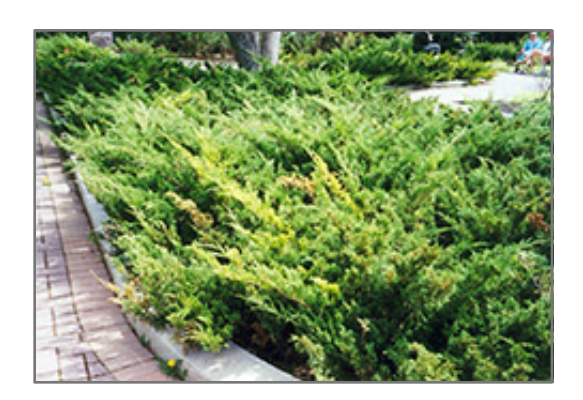
Arcadia Juniper

A highly regarded groundcover evergreen for home landscape use; very attractive and soft light green foliage, gently arching branches and a compact habit of growth; excellent in massing and groupings or as a groundcover